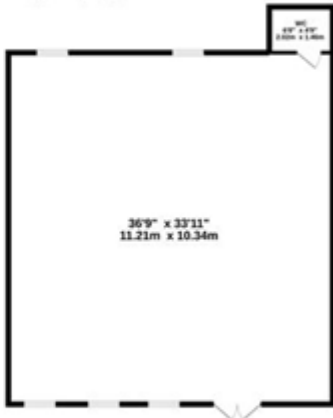
GROUND FLOOR 1279 sq.ft. (118.8 sq.m.) approx.