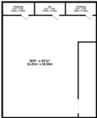
BASEMENT 1652 sq.ft. (153.4 sq.m.) approx.