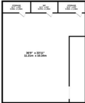
BASEMENT 1652 sq.ft. (153.4 sq.m.) approx.