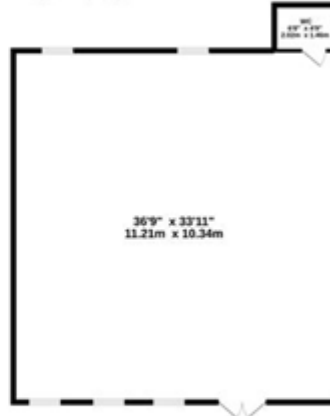
GROUND FLOOR 1279 sq.ft. (118.8 sq.m.) approx.